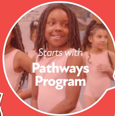
Starts with Pathways Program

Students are nurtured and engaged through in-school training and performances at K-12 public schools