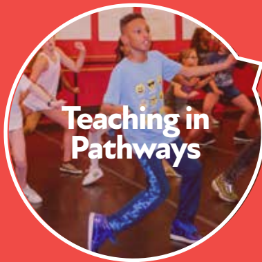
Teaching in Pathways

Once attending studio classes, students participate in a rigorous weekly and daily training regimen including rehearsals and performances and post secondary opportunities